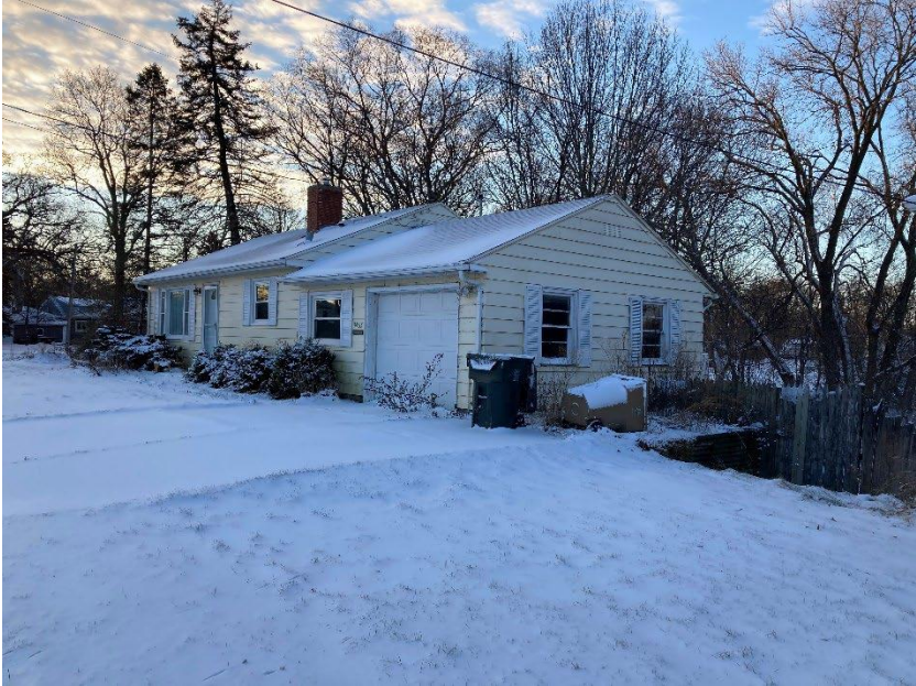
Attachment A: Pictures of 3465 Milwaukee Street