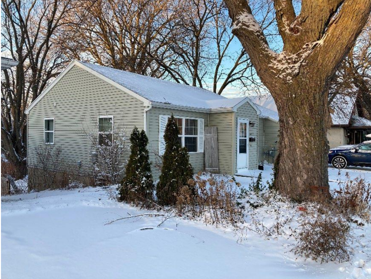
Attachment A: Pictures for 3457 Milwaukee Street