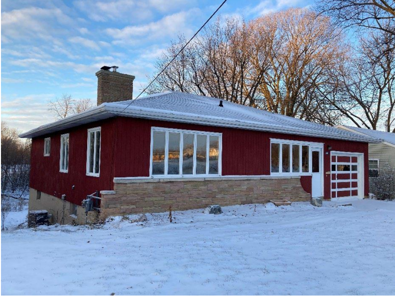
Attachment A: Pictures of 3461 Milwaukee Street